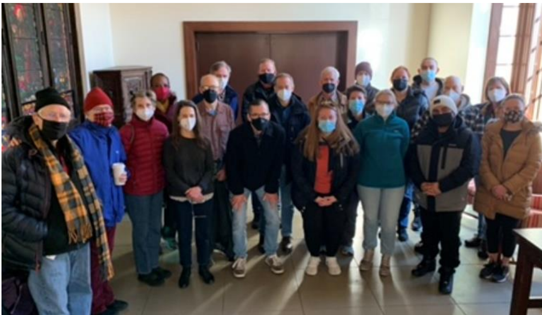
Members of the Tri-Parish Refugee Support Circle on Apartment Set Up Day, Feb 12, 2022

On behalf of the entire parish, the Vestry extends its sincere and deepest thanks to the many, many individuals at All Souls who made this success possible, whether through financial contributions, help on moving day with the apartment, help identifying or donating household items to give the family, assistance to the family with errands or medical appointments and transportation, legal support, or many other tasks. THANK YOU ALL SOULS!